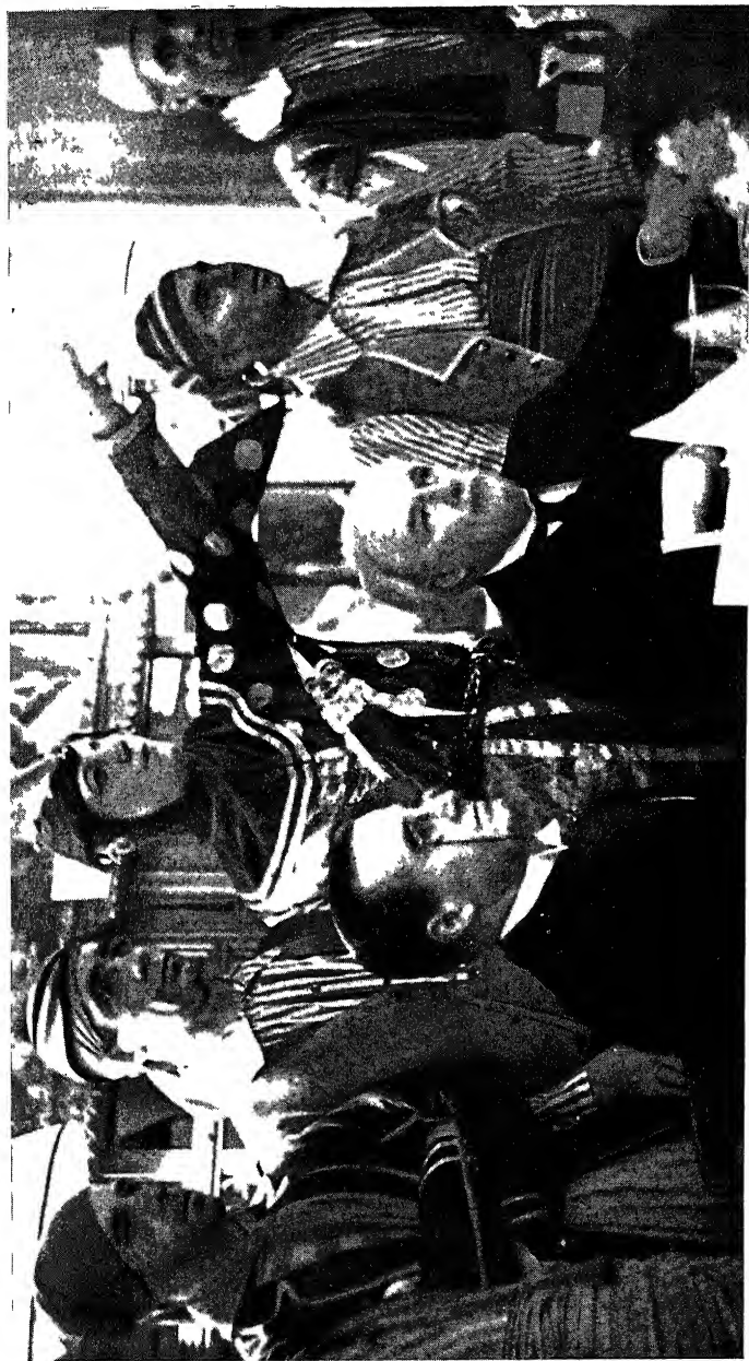
WAITERS DRESSED IN THE COSTUMES FROM THE GILBERT AND SULLIVAN OPERAS SIR HENRY LYTTON AND THE RIGHT HONBLE DAVID LLOYD GEORGE AT A LUNCHEON GIVEN TO SIR HENRY LYTTON AT THE SAVOY HOTEL